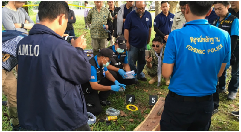
Thai law enforcement officials participated in the Counter Transnational Organized Crime training in Bangkok.

– Thai Customs officer on in-country coordination