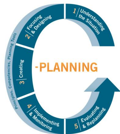
Figure 2: SBCC C-Planning